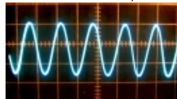
100 mW into 33 Ohm load

Maximum undistorted output mW across 33 Ohms)