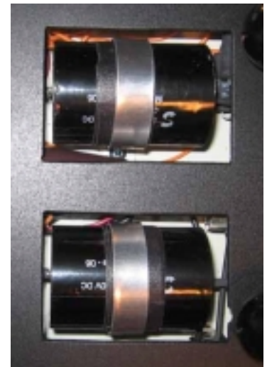
cutouts for Solens under chassis

The HD150 comes with two spare tube sockets, a JJ ECC99 and a Russian 6N6P as well as a new Tung-Sol 12AX7 and a Sovtek 5751—lots of combinations for tube rolling connoisseurs.