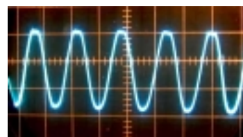
overload characteristic (120 mW)

Maximum voltage gain: 11 dB (62 dB power gain with 33 Ohm load) Output impedance at 1 kHz: less than 3 Ω Input impedance: 40 kΩ Hum and noise at output (max volume): less than 0.2 mV rms Recommended load impedance: 30–300 Ω Phase: non-inverting Power consumption: 20 W, 120 VAC 50-60 Hz